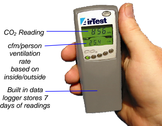
The PT9250 CO 2 & Ventilation Rate Monitor

A hand held sensor measures CO 2 concentrations and displays cfm/person ventilation rates based on the difference between inside and outside CO 2 concentrations. This type of measurement should be performed 2 to 3 hours after initial occupancy and when economizers are non operational. This quick measurement can indicate the magnitude of savings available from CO 2 based ventilation control. There is software to calculate the cost to heat and cool outside air based on your ventilation measurements and to determine payback of installing a system.